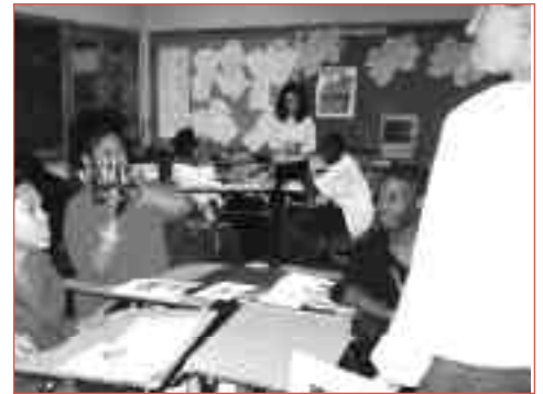
Students at Sayre High School in West Philadelphia working on the "Fruitstand" video, a project in conjunction with the University of Pennsylvania.

The Commonwealth of Pennsylvania is home to four Imagining America member institutions. Those institutions, University of Pennsylvania, Haverford College, Lafayette College, and Bucknell University, represent wide ranges of histories with campus-community partnership, from Penn's long-established relationship with its West Philadelphia neighborhood, to the innovative programs at Lafayette, and to the newly established centers at Bucknell and Haverford (see sidebar).