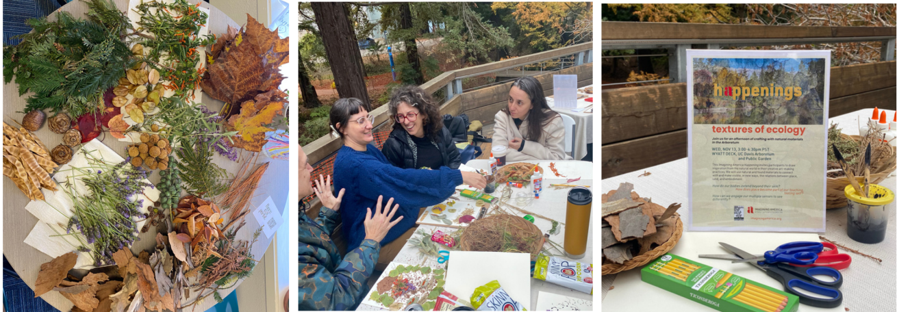
Images from IA Happening: Textures of Ecology, which inspired the 2024-2025 IA Mail Art Project