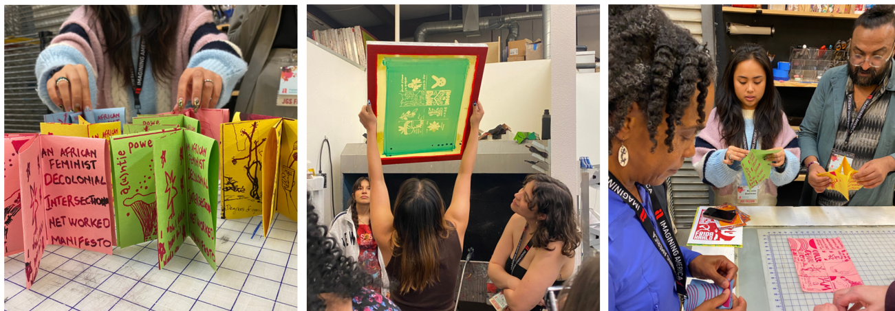
Images from the IA Engaged Arts Summit in Davis, CA