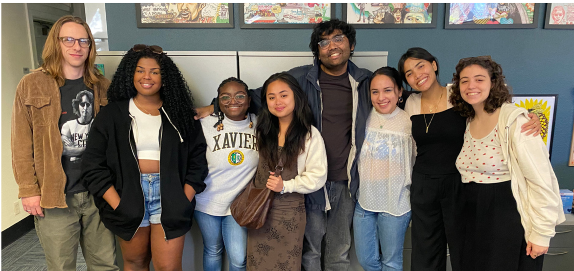
Undergraduate IA/JGS Fellows at the 2024 IA Engaged Arts Summit in Davis, CA