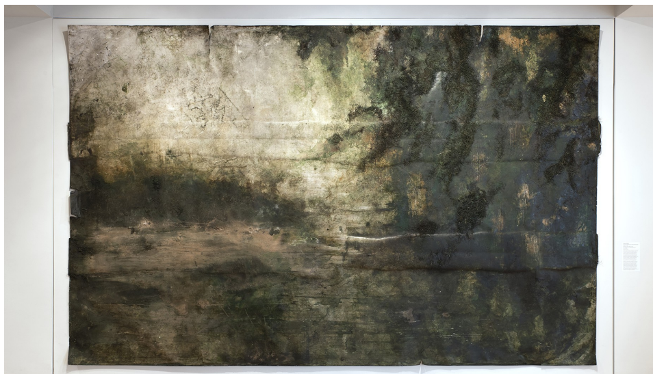
Bulbancha (Green Silence), 2019, by Athena LaTocha Shellac ink, Mississippi River mud, Spanish moss on paper featured in PUBLIC Vol. 7

IA's open access, multimedia, interdisciplinary arts, design, and humanities journal, PUBLIC , published volume 7, "The Shape of Us: Water Ways and Movements" which explored the transformative power of water through 17 pieces of creative scholarly work from members and non-members.