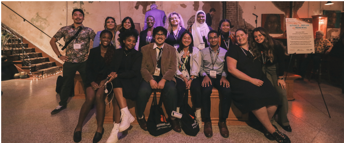
JGS Fellows at the 2022 IA National Gathering

IA supported the professional development of emerging publicly engaged scholars and practitioners by welcoming new cohorts of eight undergraduate student Joy of Giving Something Fellows and eight graduate student Publicly Active Graduate Education Fellows to the IA network. IA also continued to offer an internship program through our host campus, the University of California, Davis, and mentored four undergraduate students this past year.