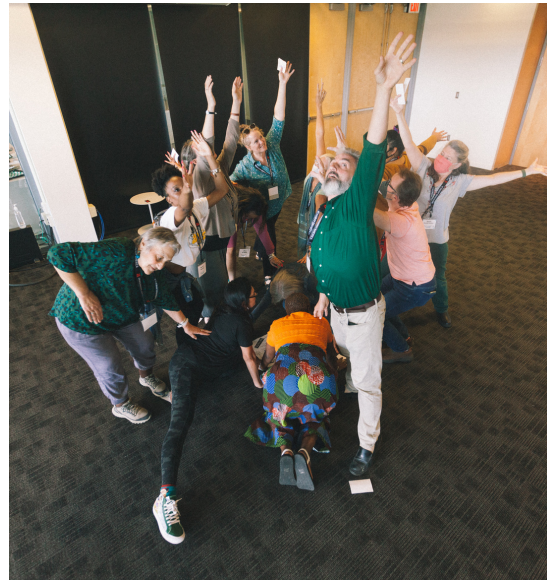
Images from sessions at the 2022 IA National Gathering

The 2022 IA National Gathering , “Rituals of Repair and Renewal,” was organized in partnership with IA member Tulane University and Ashé Cultural Arts Center and enacted rituals of repair, renewal, wellness, and imagination in the city of New Orleans, LA. This first in-person National Gathering since the start of the COVID-19 pandemic brought together over 440 students, faculty, staff, cultural producers, and national campus leaders and featured over 100 sessions. The three day event was an inspirational demonstration of IA’s mission, vision, and values, full of opportunities for members to come together, learn from one another, and dream up shared hopes and goals for the future. Following the National Gathering, over 60 IA members registered to participate in IA’s Mail Art Project and engaged with rituals of repair and renewal through creative art making and reflection.