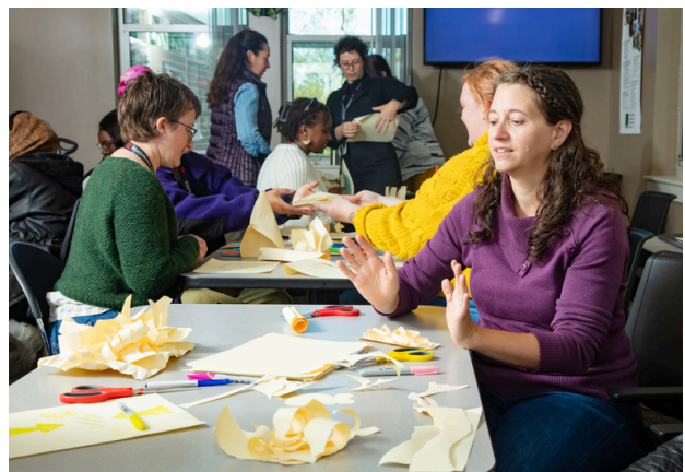
Creative sessions at the 2023 IA National Gathering.