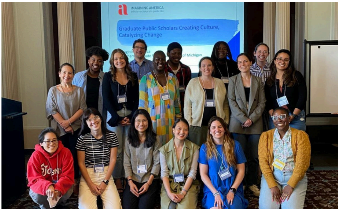
Engaged graduate scholars at IA member University of Michigan participated in the two-day workshop "Graduate Public Scholars Creating Change, Catalyzing Culture," facilitated by IA staff and PAGE fellows, and organized by the UM Rackham Graduate School.

IA focused on sharing out the creative tools developed from findings from IA's national action research project to better understand how to shift institutional culture in higher education to more fully support public and activist scholarship. The Public Scholar Conversation Cards and Public Scholar Imagination Guide were shared virtually in a members-only workshop and a public Teaching and Learning Circle (TLC) webinar in spring. Two in-person workshops with the UC Davis Center for Regional Change and with University of Michigan graduate scholars at the Rackham Graduate School expanded possibilities for the IA tools.