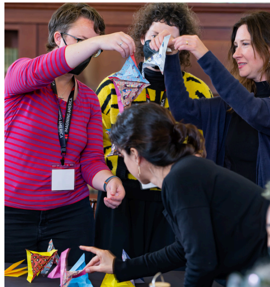
Images from sessions at the 2023 IA National Gathering.

The 2023 IA National Gathering “Radical Reckoning: Invoking the Elements for Collective Change” was organized in partnership with IA member College Unbound, AS220, and the City of Providence’s Departments of Art, Culture + Tourism, and Diversity, Equity, Inclusion and Belonging. With record setting attendance, over 630 people convened in multiple sites in Providence, Rhode Island for three days of learning, sharing, and building energy to sustain and grow commitments to public scholarship, culture change, and collective imagination towards social change. The 2023 IA National Gathering welcomed 113 students, 133 people from non-IA member higher education institutions, 200 attendees from foundations, government, non-profit, and cultural organizations, and 247 participants from IA member institutions. With support from generous sponsors, IA distributed 173 complimentary registrations to students, cultural producers, artists, and community organizations in Rhode Island. Following the National Gathering, over 70 IA members registered to participate in IA’s Mail Art Project and explored their practices of radical reckoning through creative art making.