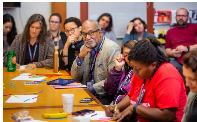
Concurrent sessions at the 2023 IA National Gathering.