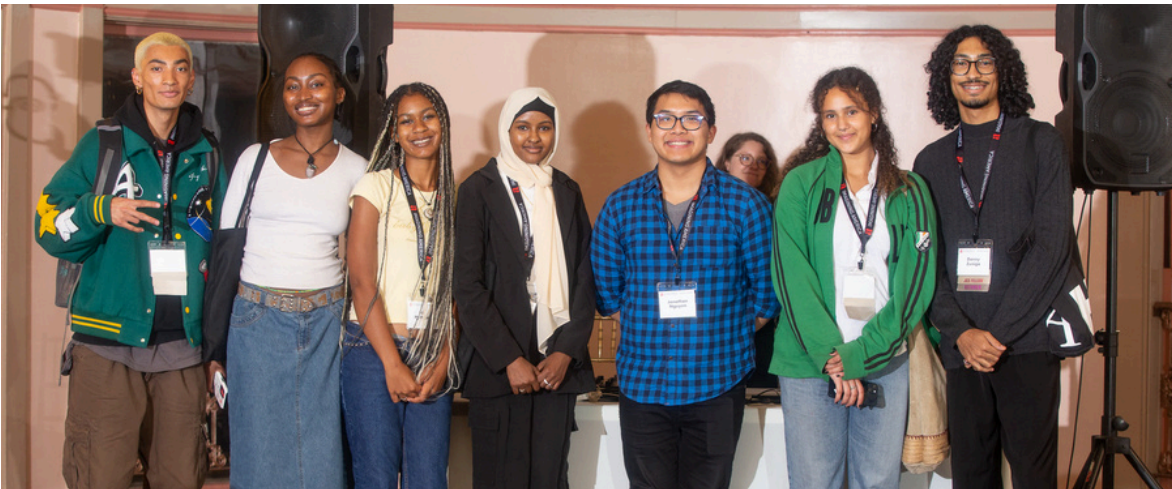
JGS Fellows at the 2023 IA National Gathering.